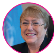
Michelle Bachelet UN High Commissioner for Human Rights and former President of Chile